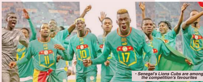
Senegal's Lions Cubs are among the competition's favourites

The former international has curved his coaching niche having worked at local clubs like AS