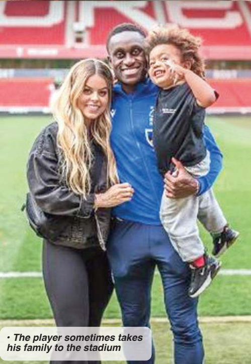
• The player sometimes takes his family to the stadium