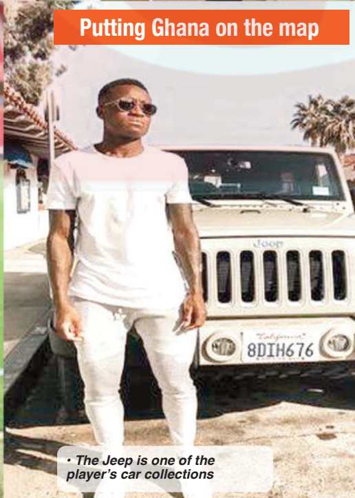
Putting Ghana on the map