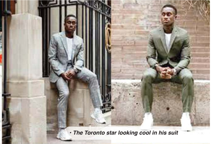
• The Toronto star looking cool in his suit