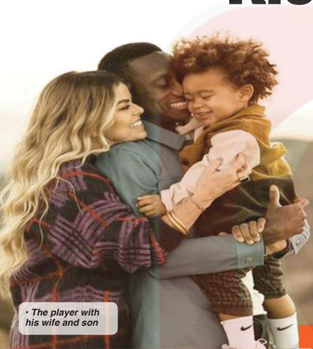
• The player with his wife and son