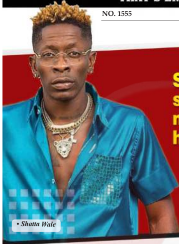
• Shatta Wale

Shatta Wale should be mindful of his actions