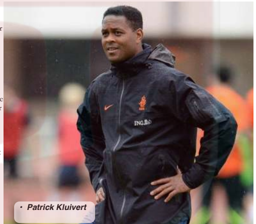
• Patrick Kluivert

In 2016, he was hired as PSG's sporting director, a position he left