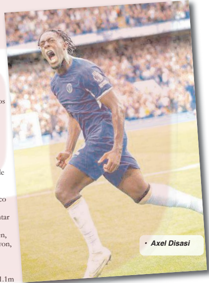
• Axel Disasi

Mason Mount (Man Utd, £55m), Mateo Kovacic (Man City, £25m), Christian Pulisic (AC Milan, £20m), Kalidou Koulibaly (Al-Hilal, £19.8m), Edouard Mendy (Al-Ahli, £15.9m), Ruben Loftus-Cheek (AC Milan, £15m), Ethan Ampadu (Leeds, £7m), N'Golo Kante (Al-Itihad, free), Cesar Azpilicueta (Atletico Madrid, free), Pierre-Emerick Aubameyang (Marseille, free), Abdul Rahman (PAOK Salonika, free).