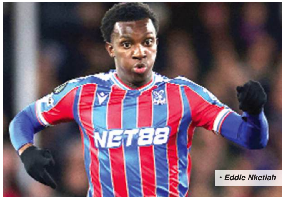
• Eddie Nketiah

Romeo Lavia - Chelsea (Midfielder; Belgium / Ghana)