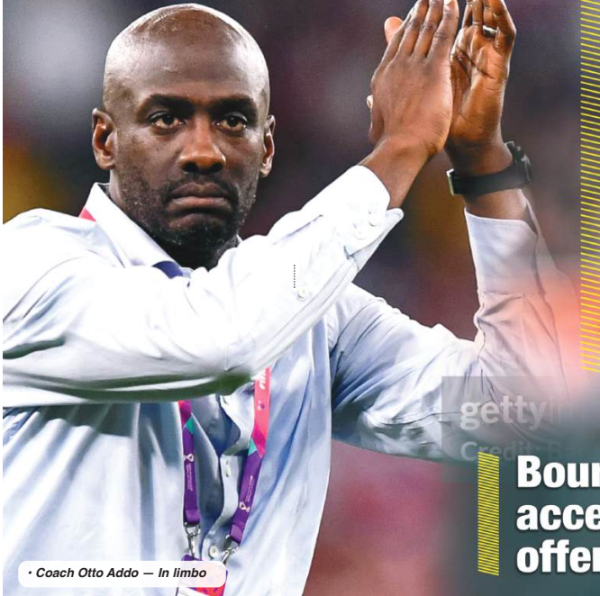
• Coach Otto Addo – In limbo