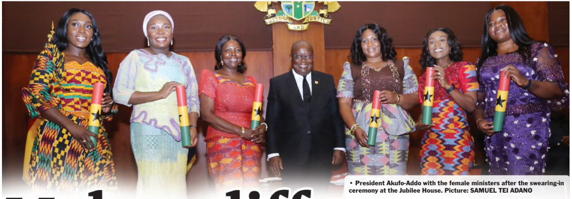
• President Akufo-Addo with the female ministers after the swearing-in ceremony at the Jubilee House.