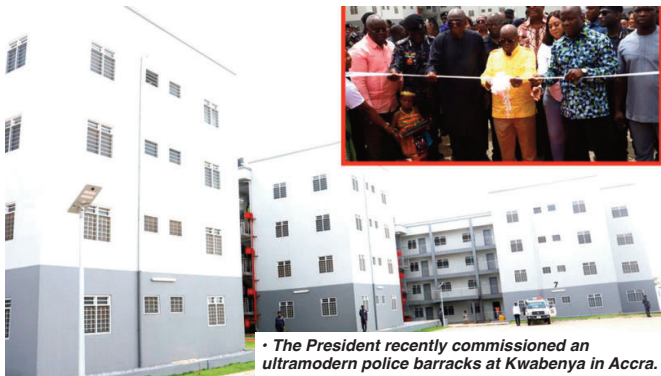
• The President recently commissioned an ultramodern police barracks in Kwabenya in Accra.