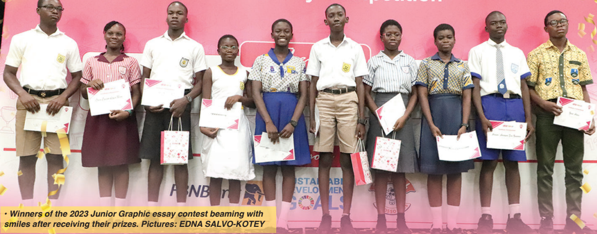
• Winners of the 2023 Junior Graphic essay contest beaming with smiles after receiving their prizes.