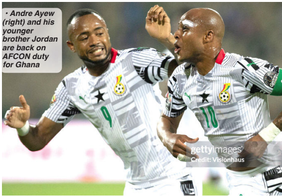
• André Ayew (right) and his younger brother Jordan are back on AFCON duty for Ghana

Their journey in the Africa Cup of Nations began in 2012, in Franceville, Gabon. André, the eldest, was already a